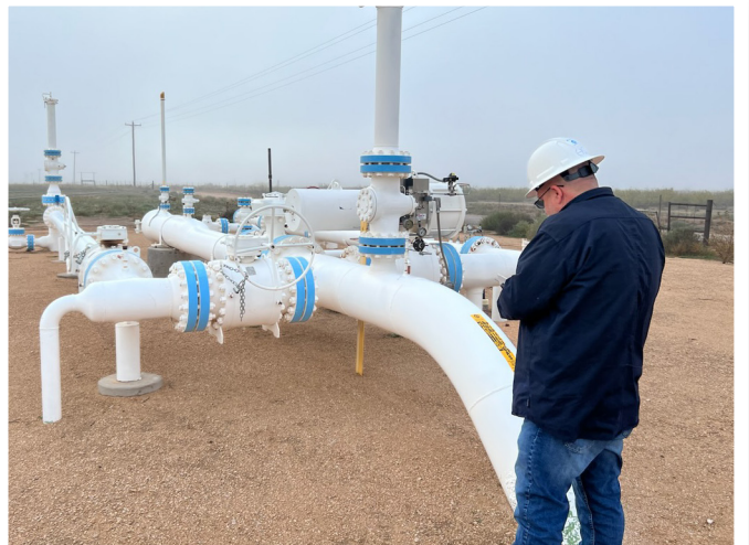
CID Winter 2023-24 Inspections