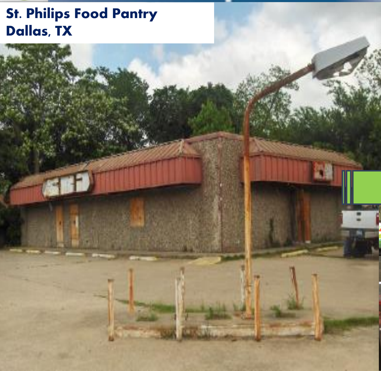
St. Philips Food Pantry Dallas, TX